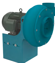
Model CIW Cast Iron Blowers

The induced draft fan generally produces a much higher CFM, ranging anywhere from 8,000 CFM to 60,000 CFM; with static pressures from 10 inches to 30 inches, depending on what fuel is used in the individual boiler system.