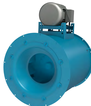
Model TSL Tubular Inline Centrifugal Fan

Customized, direct drive TSL tubular centrifugal fans with airfoil wheels